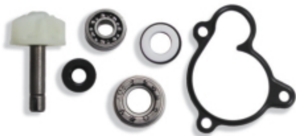
Ref. 8003 Yamaha: YP 250 Majesty.